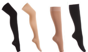
Thigh length open and closed toe