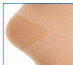
Credalast® Velvet Heel